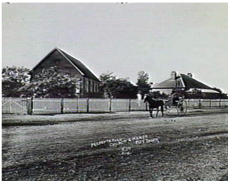
Scots Church c.1932

Car pooling is available for those without their own transport; if transport is required, please notify when booking. A map and program will be distributed on the day.