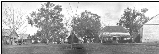
Ebenezer Church (right), Schoolmasters House and three timber slab buildings (left) in church grounds that were dismantled c.1900