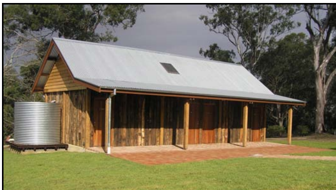
Timber slab toilet block built in church grounds in 2006

Work began in August 2005. The project was under the supervision of the church Property & Finance Committee. Finance was obtained from church fund raising, donations, a $33,000 grant from the Federal Government and a loan from the NSW Synod of the Uniting Church.